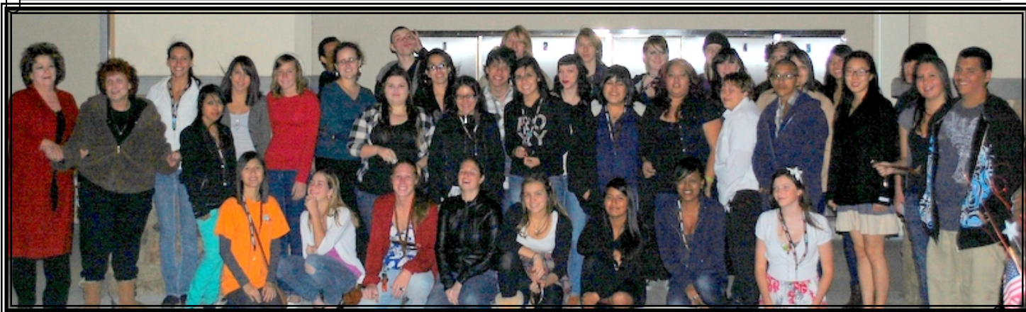
40 Hour Club