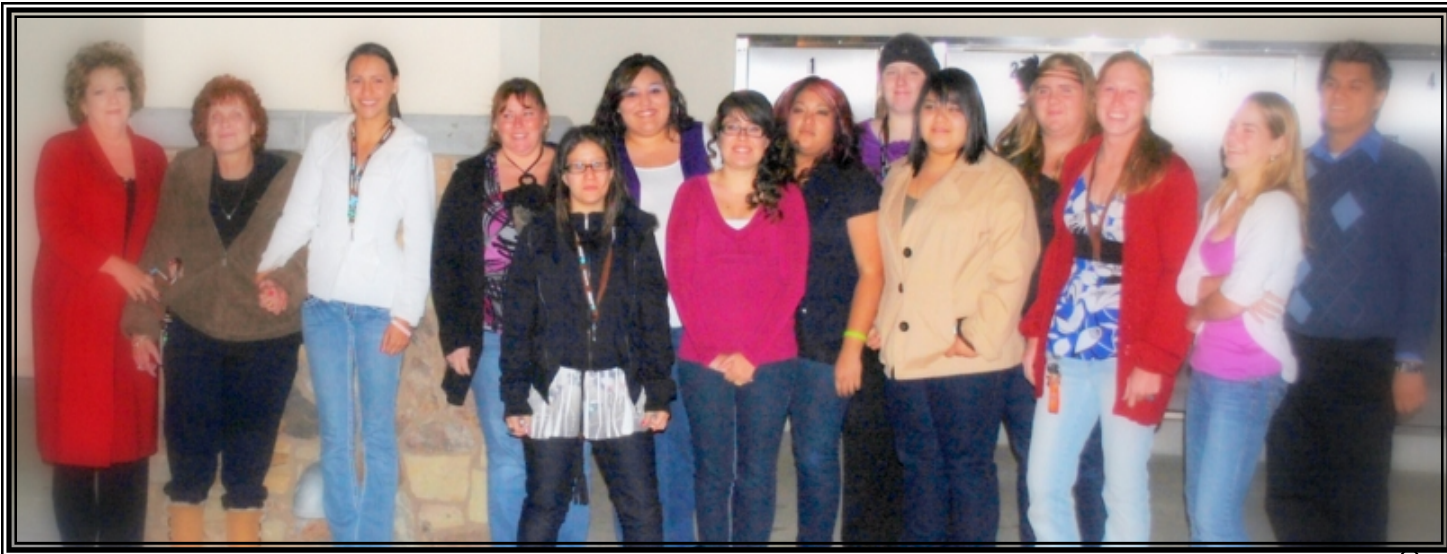
250 Hour Club