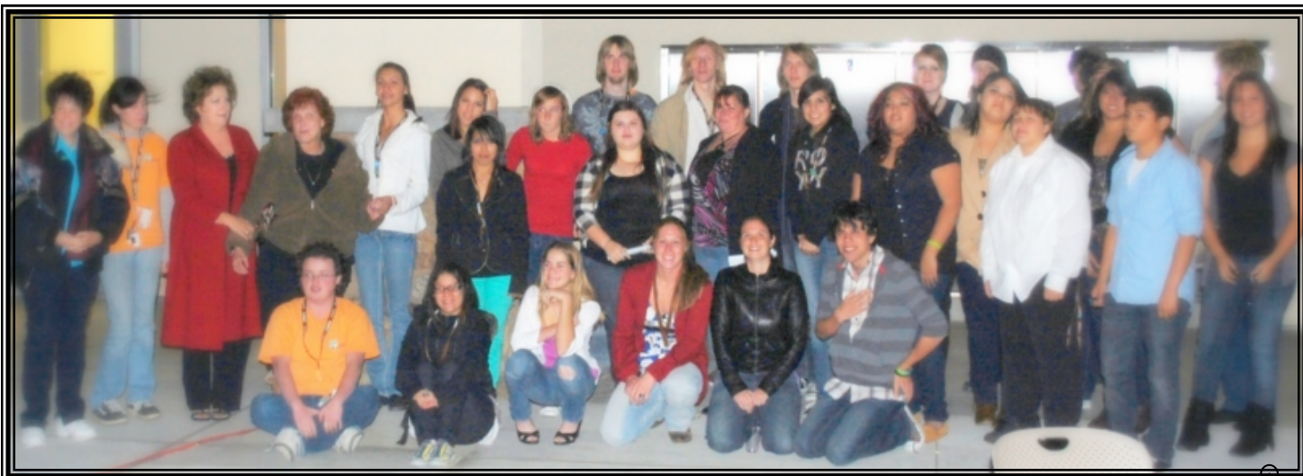
100 Hour Club