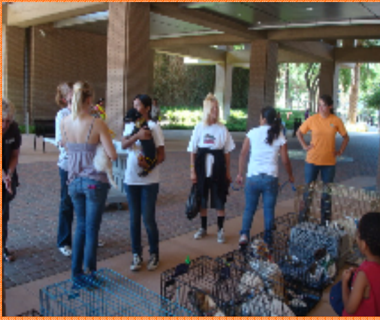
Dog Days of Summer Event at the City of Riverside