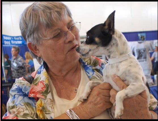
Pet Expo Pet being adopted...