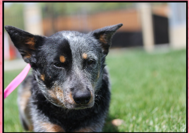
Cute dog posing for the camera...