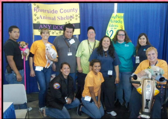
Sunday's Pet Expo team!