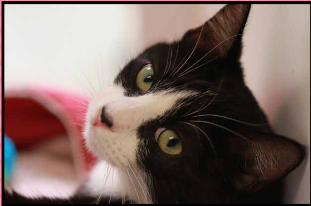
A cat caught on camera...